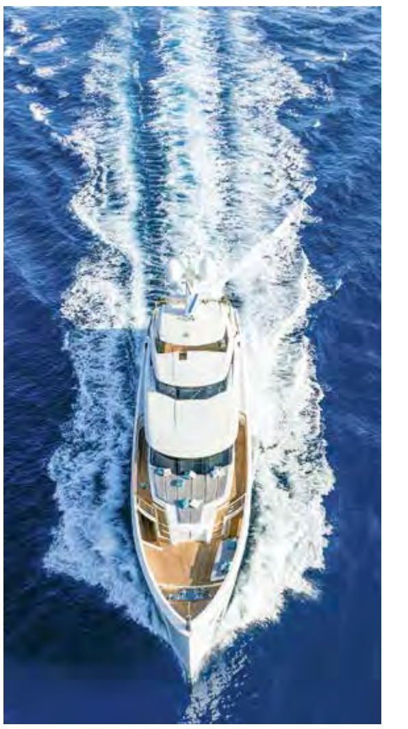
ShowBoats International | June 2016