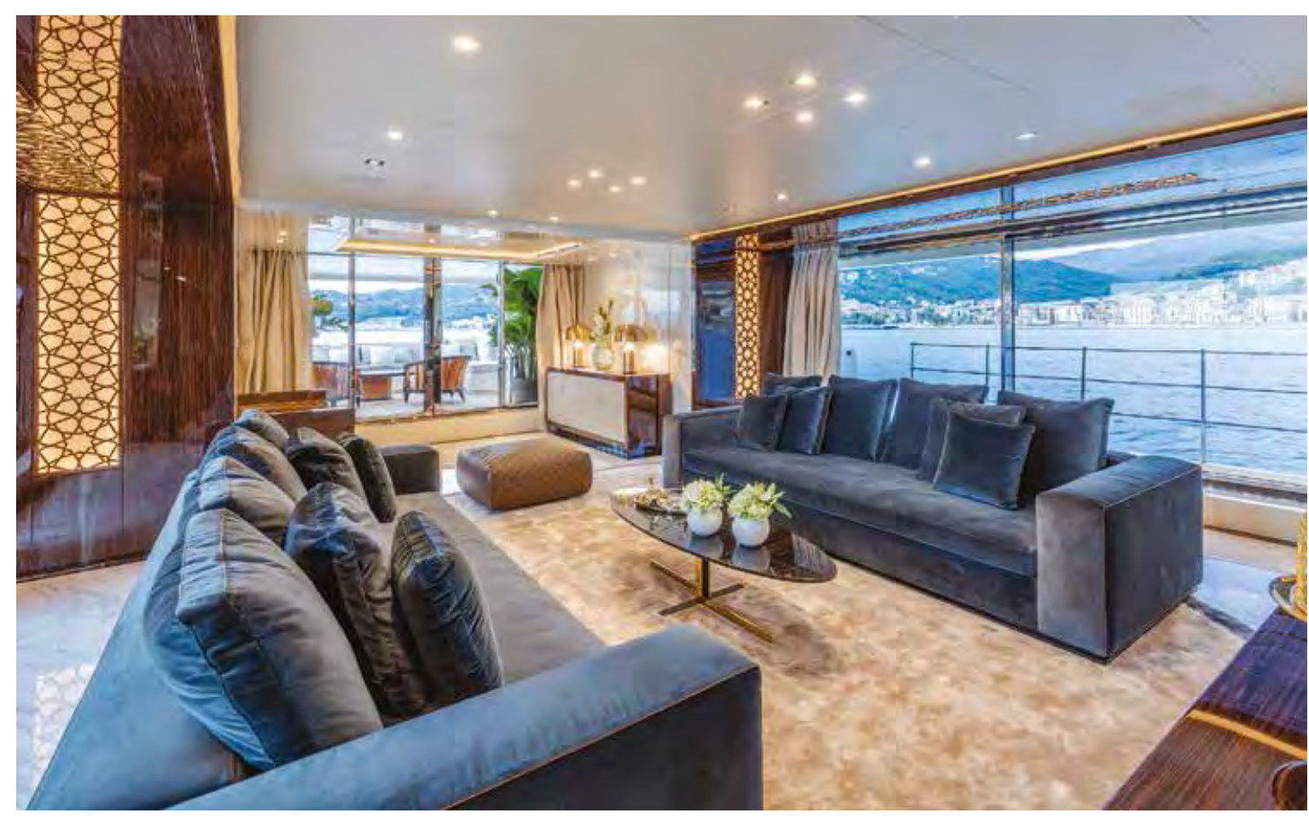
Above: Full-height windows in the main salon, as well as fold-down balconies on either side, turn this space into "a floating terrace." Below: Bright-green vertical gardens over the beds in the guest cabins are part of Serenity's distinctive décor.