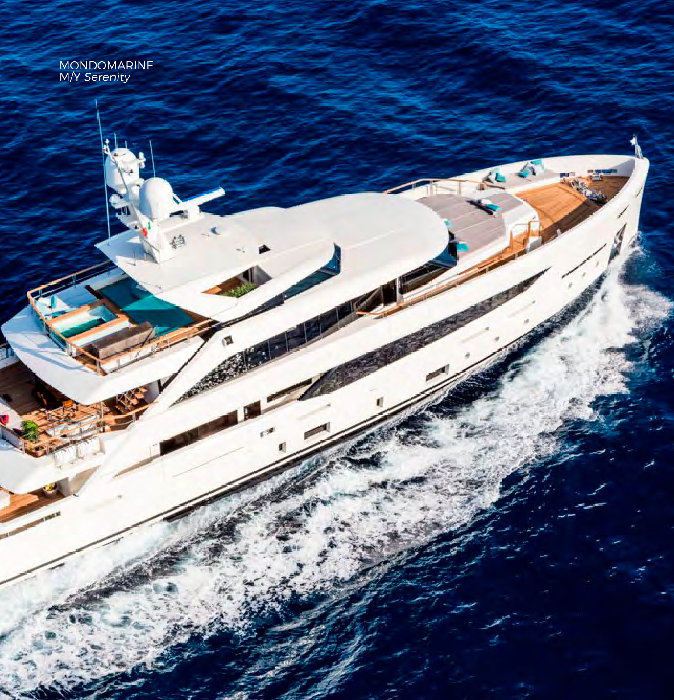
MONDOMARINE M/Y Serenity

Once upon a time, an enchanted, captivating, charming megayacht, named Serenity , set sail from Savona to Dubai.