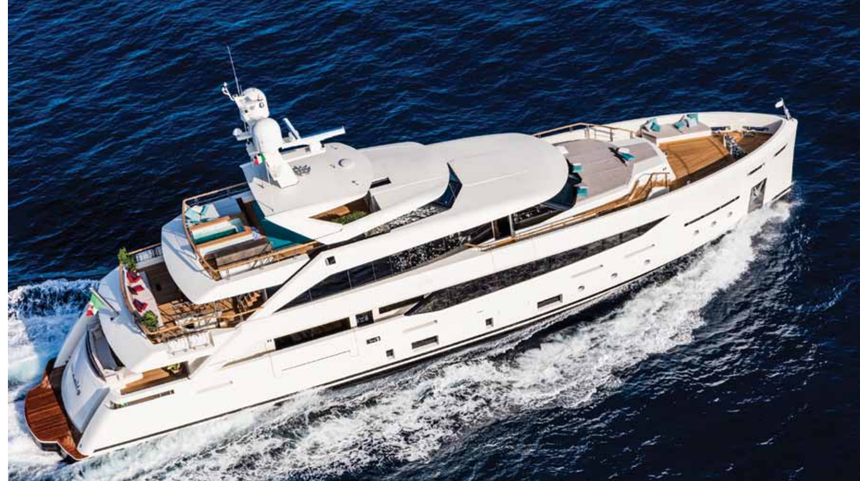
ABOVE: Mondomarine chose emerging designer Luca Vallebona to pen the exterior lines of 139-foot Serenity . BELOW: The sundeck is all about fun in the sun. OPPOSITE PAGE: The interior design by Fatema Almaidan draws on Western and Middle Eastern cultural cues.

The split-level arrangement provides space for a technical deck for the mooring hardware and rescue tender that are housed out of sight under the foredeck, but relegates the wheelhouse to the sun-deck (and the captain's cabin to the lower deck) as a raised pilot-house. Nonetheless, the wheelhouse is equipped with wing stations and an integrated bridge with electronics engineering by Pariani, which specializes in consoles for the aviation industry. Unusual for a yacht of her size, Serenity also has an inspection tunnel linking the engine room with the forward crew quarters.