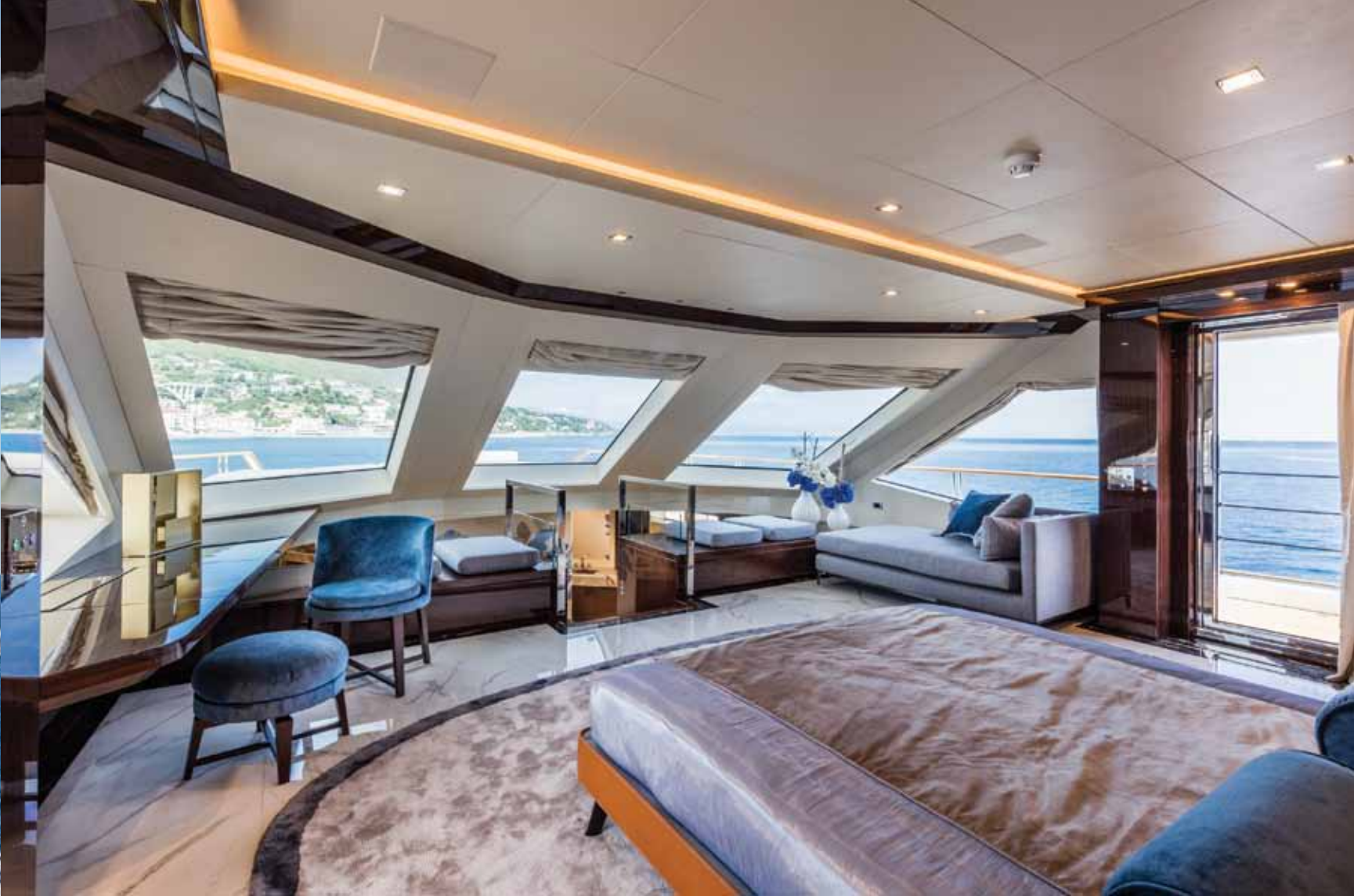
ABOVE AND OPPOSITE PAGE: The split-level layout provides the owner's stateroom on the upper deck with unhindered forward views.

Another request of the owner's was for a very stable boat. Initial studies into a hybrid stabilization system using gyros combined with conventional fins proved unfeasible at semi-displacement speeds. Instead, the shipyard opted for hydraulic zero-speed stabilizers, but at more than 37 square feet (3.5 square meters) apiece, the fins are considerably larger than the norm for the size of the yacht. Although they necessarily produce more resistance, the yacht's maximum speed is still 2 knots faster than the contractual requirement.