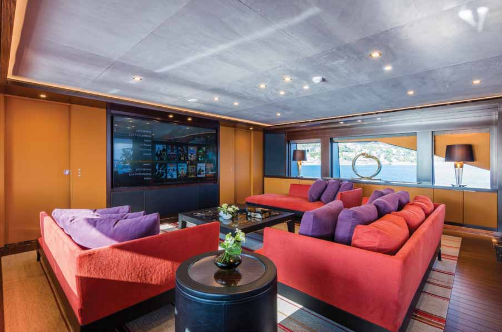
ABOVE: The color palette in the sky lounge/cinema room is particularly bright and breezy. RIGHT: The cavernous owner's bathroom with its central tub.

High-gloss surfaces and polished stone may be luxurious, but they can also appear a mite frosty, so Almaidan selected bespoke silk and velvet fabrics supplied by an artisan firm in Florence in shades of warm plum and brick red, and added a bioethanol fireplace in the main salon. Ceramic mosaics are part and parcel of the Moorish culture, and the designer came up with her own interpretation in the owner's bathroom—in many ways the interior centerpiece—that features an intricate mosaic of blue roses in Bisazza tiles on the curved partition between the bathtub and shower stall. For the rest, the interior is decidedly Mediterranean in tone with furnishings and fixtures by high-end Italian brands such as Poltrona Frau, Donghia, Promemoria and Artemide, and a crystal glass chandelier over the dining table by Patrizia Garganti.